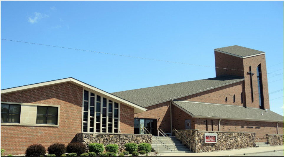
Worship with us onsite Sundays at 10:30 a.m.